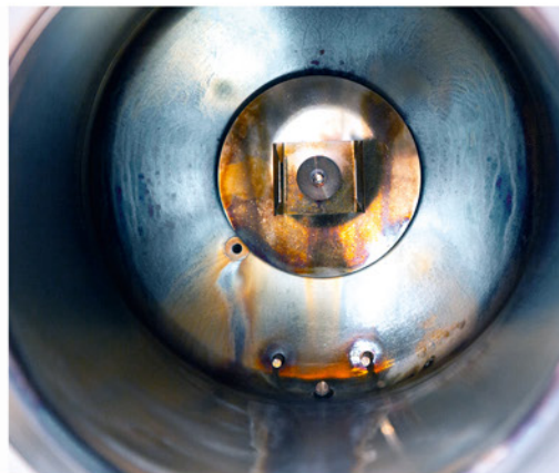
Without regular chamber cleaning